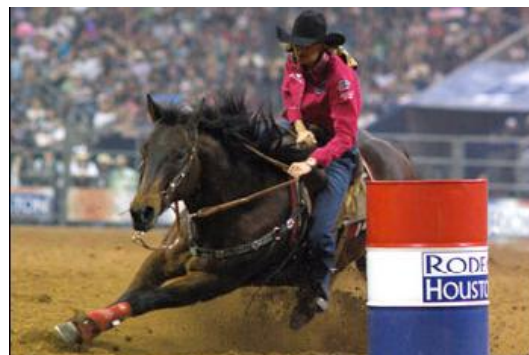
Houston Livestock Show and Rodeo ( rodeohouston.com )

12:15-1:45 Lunch and group picture 1:45-2:00 UHCO Tour overview 2:00-4:00 School tours & research presentations (6 groups) 4:00-4:30 Sponsor presentations 4:40 Buses depart for hotel 6:30 Dinner & entertainment