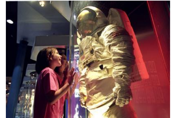
Houston Space Center ( spacecenter.org )

7:00-8:00 Breakfast at hotel 8:00-9:30 Sponsor presentations Austin Room Four Seasons 9:30-10:00 The Teaching Role of in-Vivo Confocal Microscopy