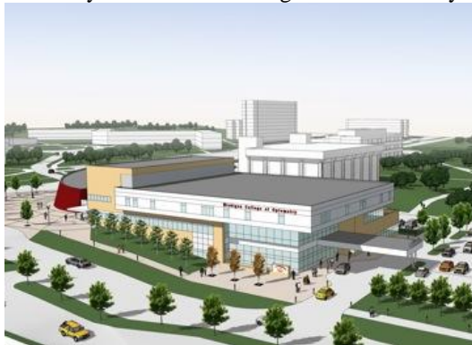
Sketch of the new Michigan College of Optometry facilities

On May 8 the college had a groundbreaking ceremony for its new building. The new facility