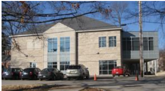
The new IUSO clinic

The new Indiana University School of Optometry clinic opened on January 5, 2009. Previously located on the second floor of the Optometry building, the new clinic is across the street on the south side of the main campus. This 20,000 sq ft facility includes 30+ examination lanes, special testing rooms and better access for elderly and physically challenged patients.