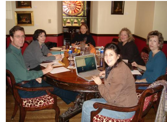
Your hard-working AOCLE officers at the mid-year planning meeting

One of the more fruitful parts of the meeting was the START-CONTINUE-STOP portion of the program. This open exchange allowed the attendees and Professional Affairs personnel to discuss areas where CIBA should initiate programs, continue successful ones, or stop certain products/programs. This is a useful brainstorming session whereby educators can really express some of the needs of the academic setting and the needs that are particular to their institution.