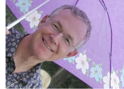
More Cooper fun in DC