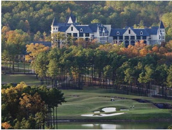
Hotel: Renaissance Ross Bridge Golf Resort & Spa