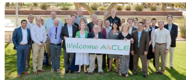
A photo of all the sponsors of the 2014 AOCLE meeting at AZCOPT. Thanks for your support!