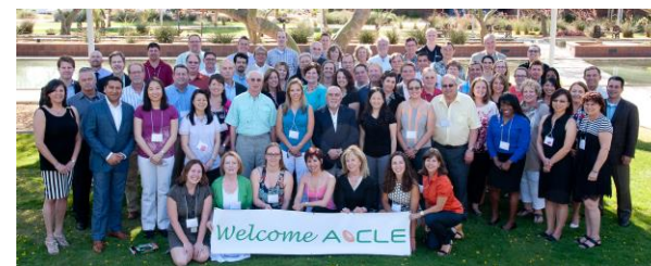
A photo of all the attendees at the 2014 AOCLE meeting at AZCOPT.